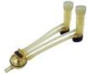
Goat Cluster from MS (e.g. 612909 /Corr.F96CAPRICTMS)